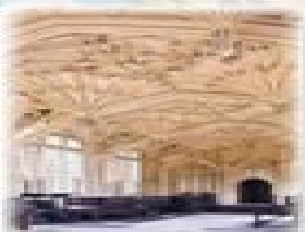
1. Bodleian Library - Divinity Hall