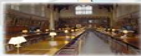
5. Christ Church Great Hall