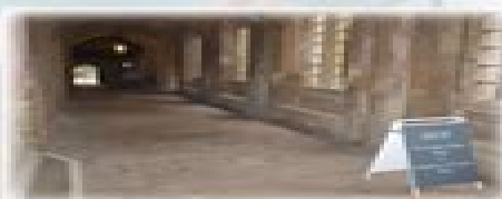
7. Christ Church Cloisters