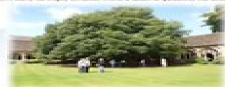
3. New College Cloisters