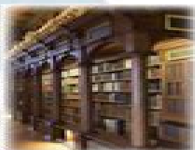
2. Bodleian Library - Duke Humphries Library