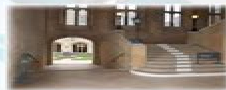
6. Christ Church Stairway (bottom)