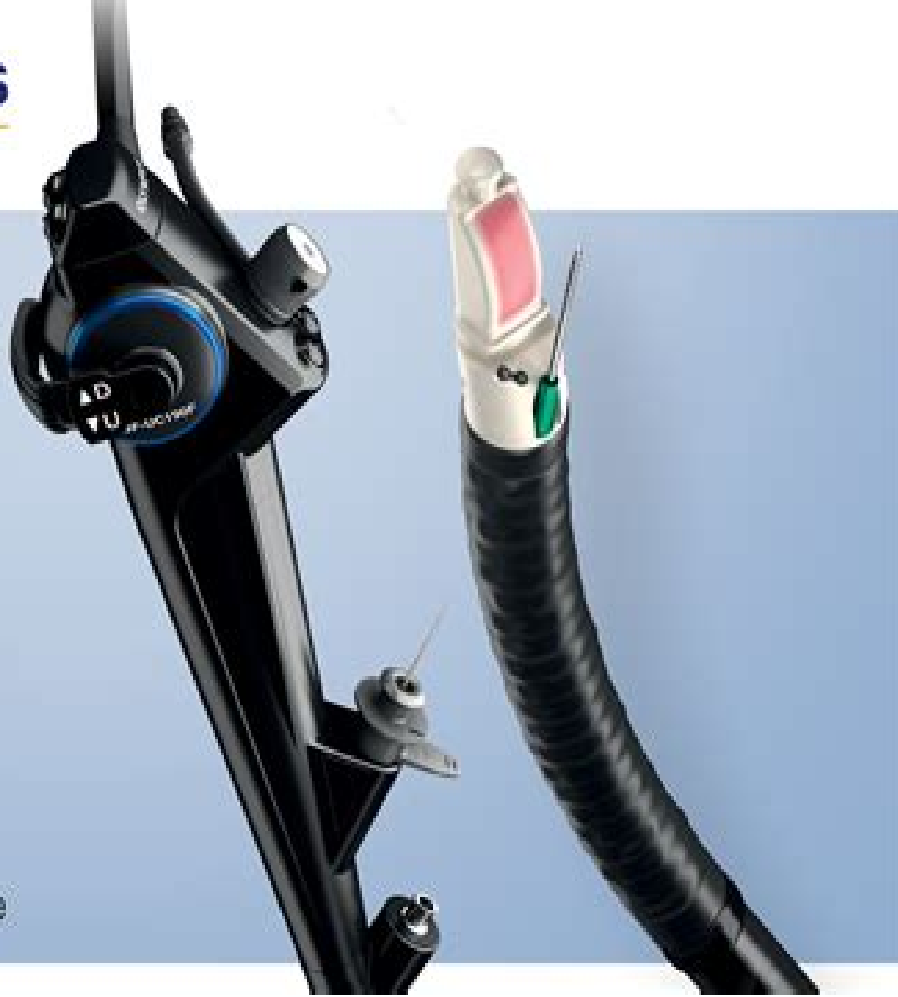
BF-UC190F EBUS Bronchoscope