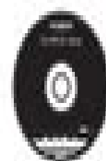
OLYMPUS Setup CD-ROM