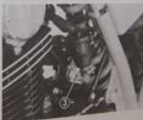
(3) Transparent section