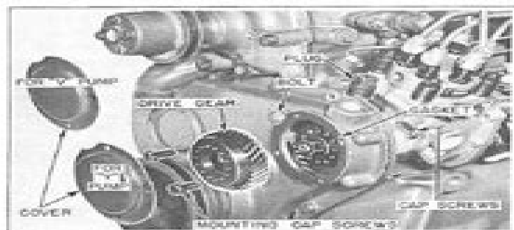
Figure 3-218 Installing Injection Pump