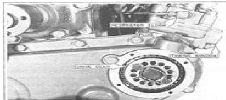
Figure 3-221 Injection Pump Drive Gear Installed