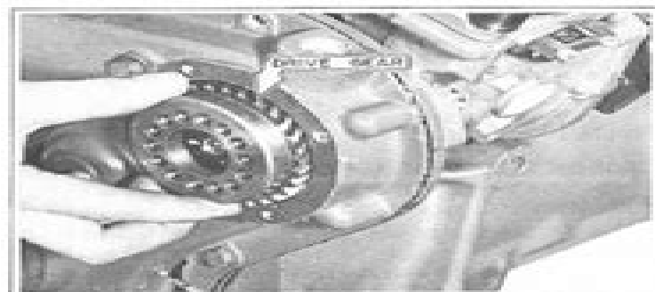
Figure 3-219 Installing Injection Pump Drive Gear