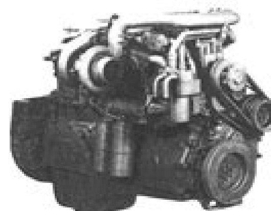
Big Cam IV