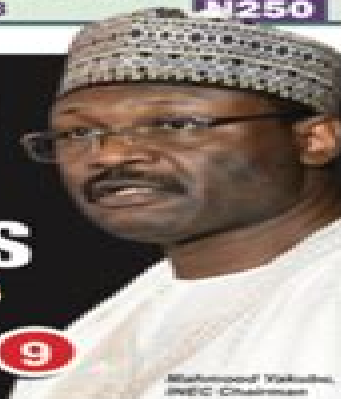
Mahmood Yakubu, INEC Chairman