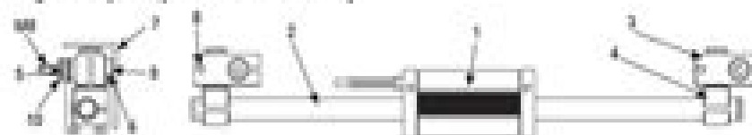
Figure 1 - Spherosyn300 Encoder Assembly