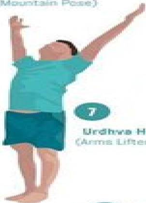
Urdhva Hastasana (Arms Lifted Overhead)