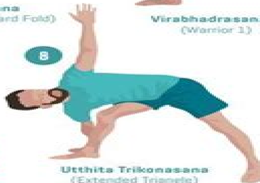
Utthita Trikonasana (Extended Triangle)