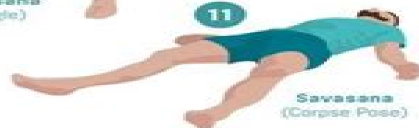
Savasana (Corpse Pose)