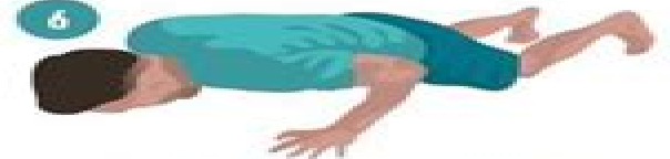
Chaturanga Dandasana (Four-Limbed Staff)