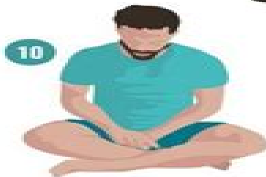
Sukhasana (Easy Pose)