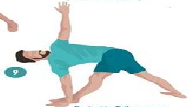
Parivrtta Trikonasana (Revolved Triangle)