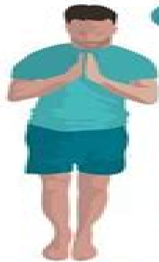
Tadasana (Mountain Pose)