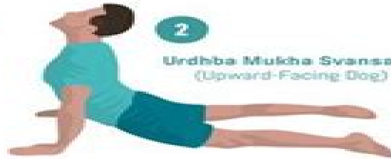
Urdhva Mukha Svansana (Upward-Facing Dog)