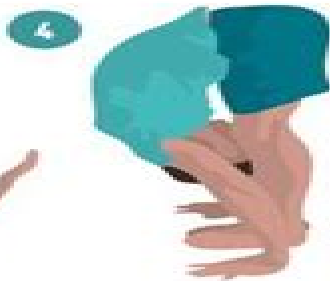
Uttanasana (Standing Forward Fold)