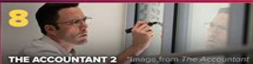
THE ACCOUNTANT 2