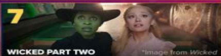
WICKED PART TWO