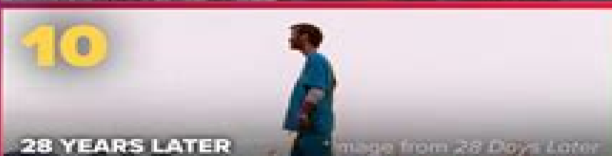
28 YEARS LATER