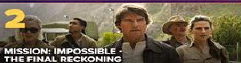
MISSION: IMPOSSIBLE - THE FINAL RECKONING