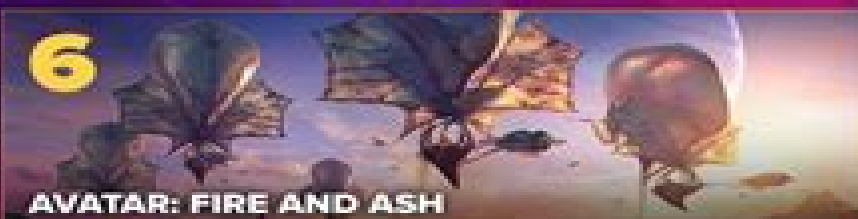
AVATAR: FIRE AND ASH