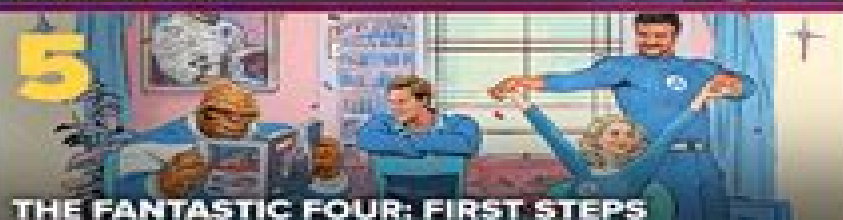
THE FANTASTIC FOUR: FIRST STEPS