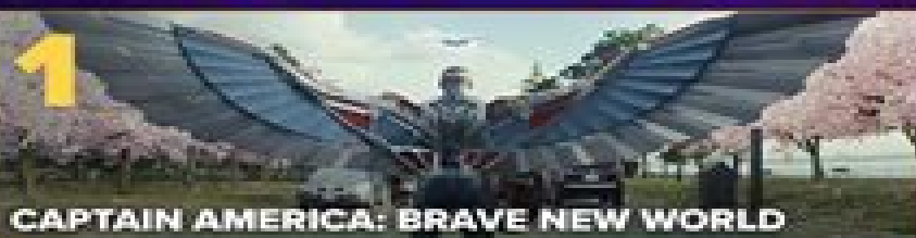
CAPTAIN AMERICA: BRAVE NEW WORLD