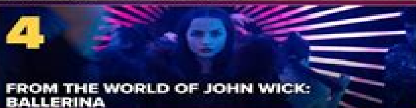
FROM THE WORLD OF JOHN WICK: BALLERINA