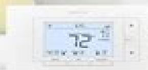
Sensi Smart Thermostats