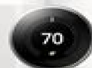
Nest Smart Thermostats