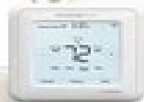
Honeywell Smart Thermostats