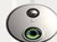
Skybell Wifi Doorbells