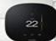
Ecobee Smart Thermostats