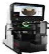
Symbolic Floor Model

Angles A, B, and C, all subtended by chord AB, are equal.