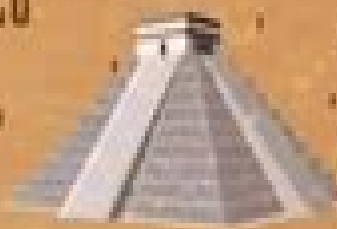
CHICHEN ITZA YUCATÁN