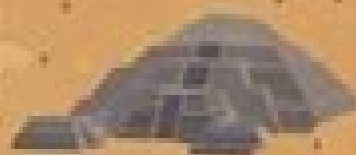
TEOTIHUACÁN EDO DE MÉXICO