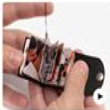
Mini Photo Album Keychain - Personalized Gift, Personalized...

★★★★★ (10,257) $48.00 $64.00 (25% off) FREE shipping