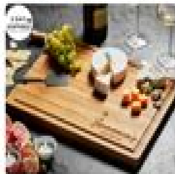
Personalized Cutting Board Wedding Gift, Customize your...

★★★★★ (3,328) $29.99 $44.99 (33% off) FREE shipping