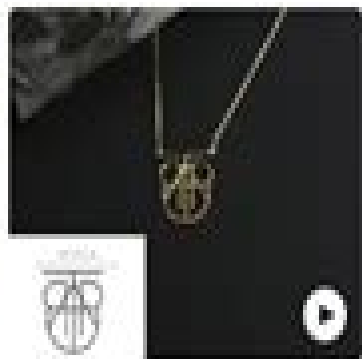
Personalized Name Necklace, Gift for Her, Personalized Gift,...

★★★★★ (3,328) $29.99 $44.99 (33% off) FREE shipping