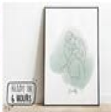
Custom Line Drawing, Custom Fathers day gift, Gift for Dad,...

★★★★★ (4,191) $9.00 $44.00 (79% off) FREE shipping