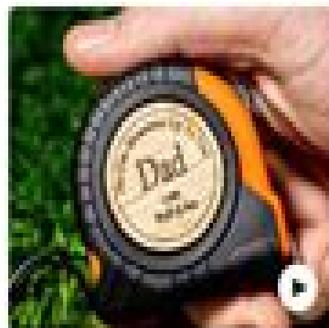
No One Measures Up Personalized Tape Measure,...