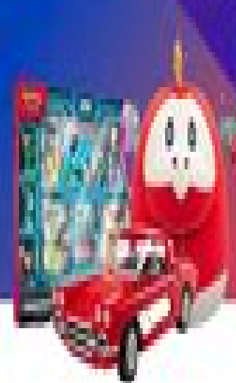
Select toys and collections