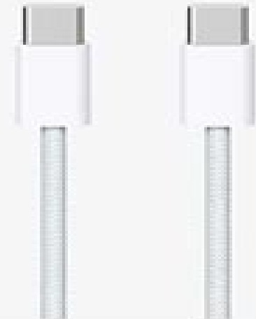
USB-C Power Adapter