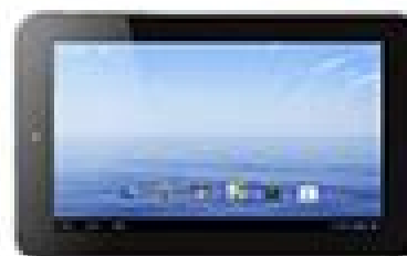
Nextbook 7" Tablet, 8GB