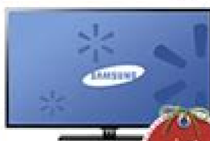
55" Samsung LED TV