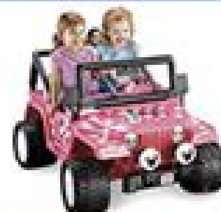
Fisher-Price Minnie Mouse Jeep Ride-On