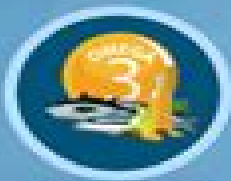
Omega 3 Fatty Acids