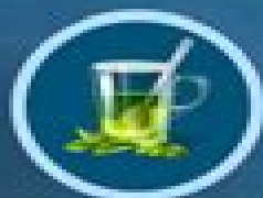
Green Tea (EGCG)