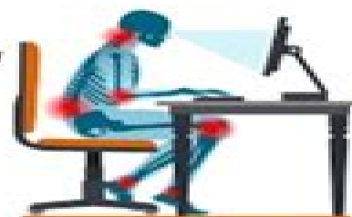
❌ WRONG SITTING POSTURE