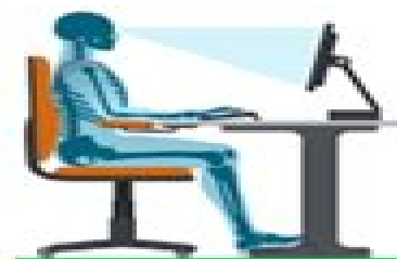
✅ CORRECT SITTING POSTURE