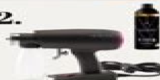
SPRAY TAN MACHINE