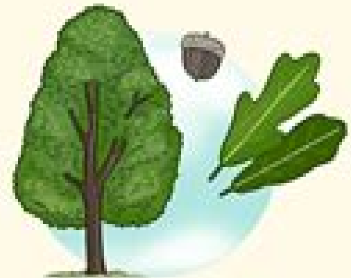
Water oak ( Quercus nigra )