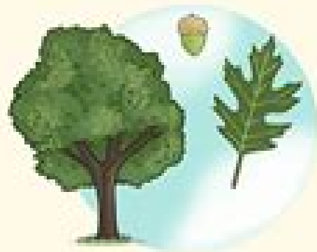
Black oak ( Quercus velutina )