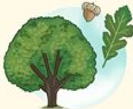
Bur oak ( Quercus macrocarpa )