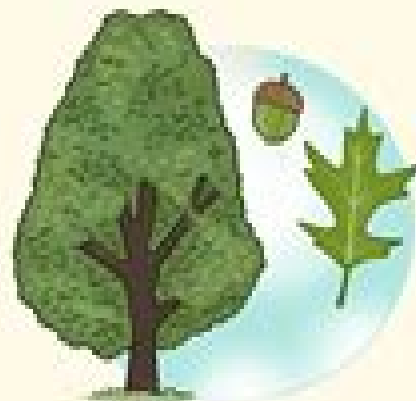
Pin oak ( Quercus palustris )