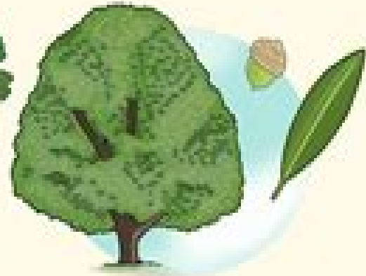
Laurel oak ( Quercus laurifolia )