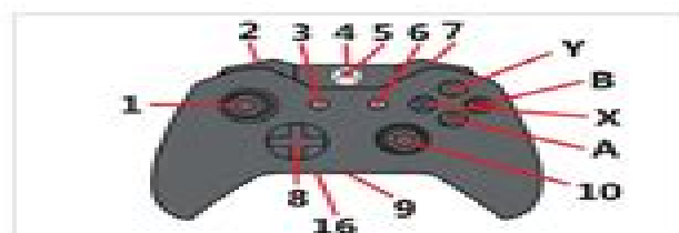
Original Xbox One Wireless Controller