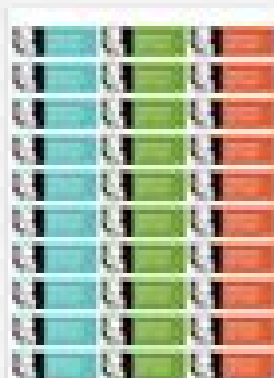
Photo address labels