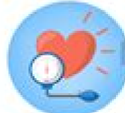
HIGH BLOOD PRESSURE