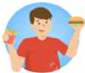
EATING TOO MUCH