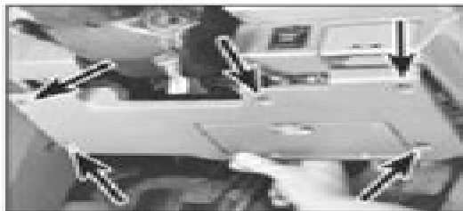
writing of panel frontal inferior direction

1) Desconecte el cable negativo de la batería. 2) Con un instrumento de tija plana adecuado, extraiga con cuidado la tira decorativa de montaje del reloj del panel frontal. Retire la moldura y desconecte el conector de cableado de la parte trasera del reloj. Ate un trozo de cuerda alrededor del conector para evitar que vuelva a caer dentro del compartimento. (ver Ilustración 6)