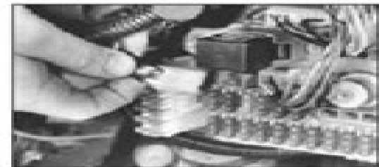
Fig. 10. ... y desconecta los conectores de cableado del frente de la caja de fusibles

las operaciones de los interruptores de las luces interiores, los interruptores de los limpiaparabrisas y el interruptor de los faros darán como resultado un pítido de la MPU cuando reciba una señal. Si la unidad no emite un pítido, se indica una falla en el circuito correspondiente. Al presionar por tercera vez el interruptor de la ventana trasera térmica, la MPU entrará en la segunda etapa de su secuencia de diagnóstico. La MPU ahora operará cada una de sus funciones por turnos, comenzando con la ventana trasera térmica, seguida por los limpiaparabrisas delantero y trasero y, finalmente, la luz de cortesia. Funcionará durante aproximadamente dos segundos si no hay fallas. Cuando se hayan completado todas las comprobaciones, apague el interruptor de encendido para sacar la MPU de su secuencia de diagnóstico.