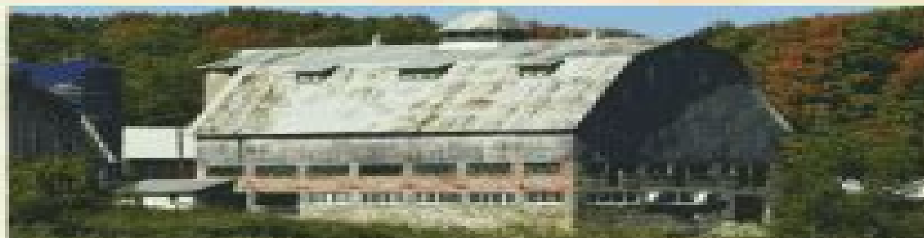
The Parsons Barn was an excellent example of the importance of ongoing barn restoration.