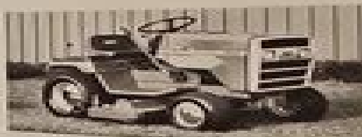
MF 1200 GARDEN TRACTOR AND MOWERS