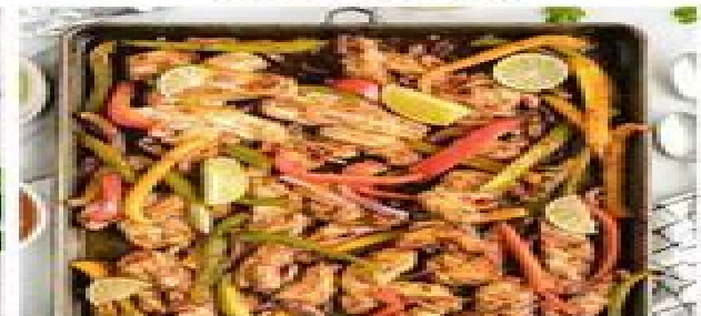
SHEET PAN FAJITAS