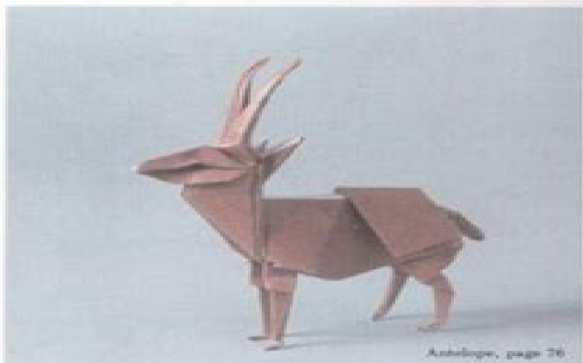
Antelope, page 76