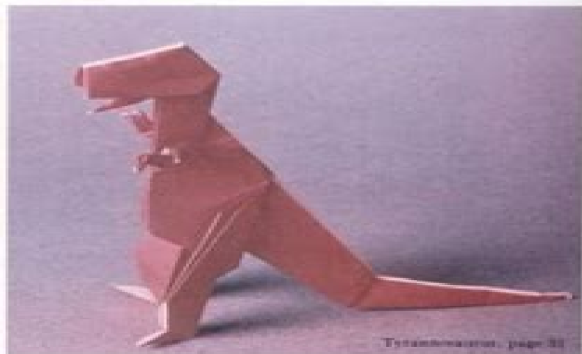
Tyrannosaurus, page 30