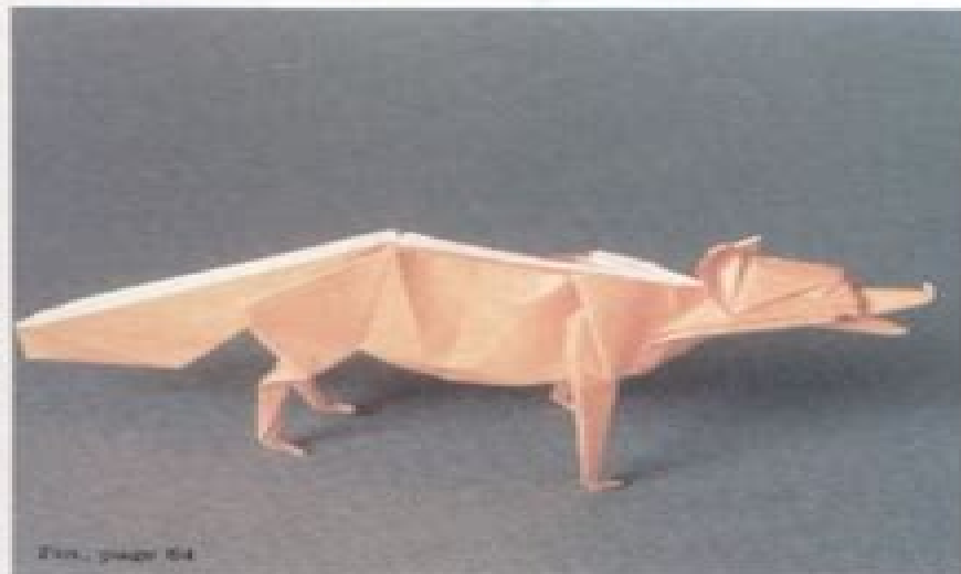
Fox, page 64