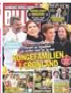
Billed-Bladet – 4 Juli 2024