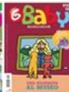
G Baby – Luglio 2024