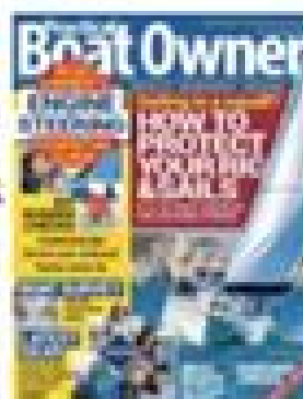
Practical Boat Owner – August 2024