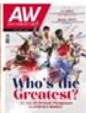
Athletics Weekly – July 2024