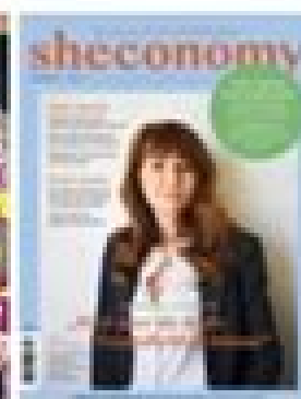
Sheconomy – Juli 2024