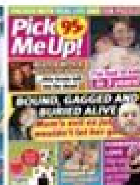
Pick Me Up! – 11 July 2024