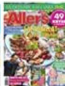
Allers – 4 Juli 2024