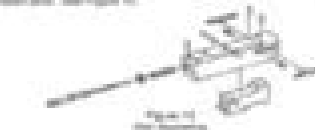
Figure 2-1-3 Action Bar Assembly

The Action Bar Assembly consists of the action bar, action bar spring, action bar pin, and action bar nut. See Figure 2-1-3.