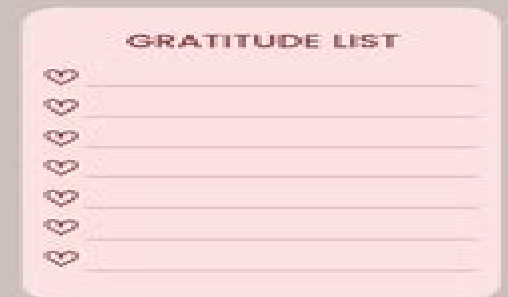
5 minute journal