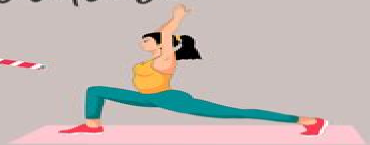
10 minute stretch