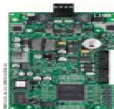
Loop Control Module

Temperature and humidity ranges: This system meets NFPA requirements for operation at 0 – 45°C/32 – 120°F and at a relative humidity 90% ± 2% RH (noncondensing) at 32°C ± 2°C (90°F ± 3°F). However, the useful life of the system's standby batteries and the electronic components may be adversely affected by extreme temperature ranges and humidity. Therefore, it is recommended that this system and its peripherals be installed in an environment with a normal room temperature of 15 – 27°C/60 – 80°F.