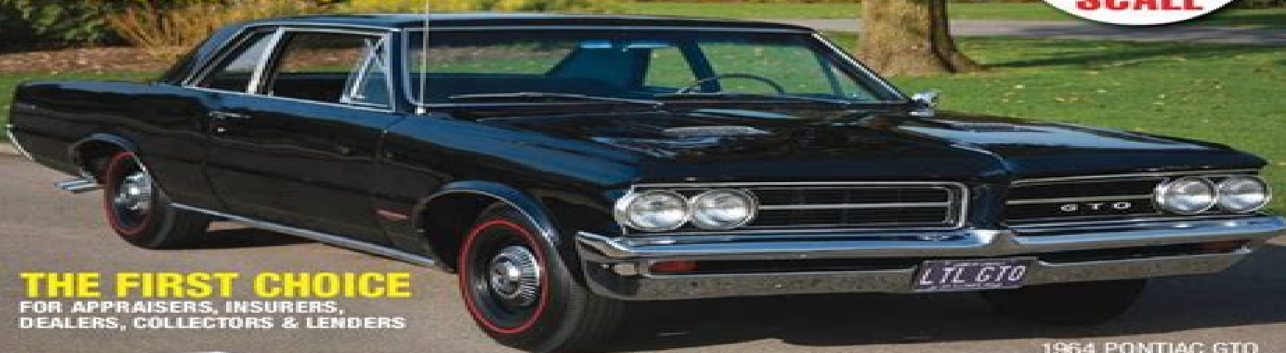
1964 PONTIAC GTO

THE FIRST CHOICE FOR APPRAISERS, INSURERS, DEALERS, COLLECTORS & LENDERS