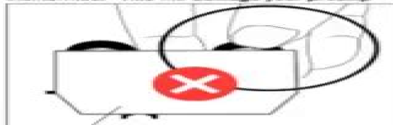
Bottom of Amulet Ultra preamp - velcro side

DO NOT hold or pull on the preamp by the thumbwheel - This will damage your preamp