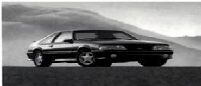
1993 Mustang

Since it was based of the successful Fox Body chassis that includes the Fairmount and the Thunderbird, this allows the 1979-1993 Mustang to share with its older siblings, which is a great benefit to Mustang owners. When the car was new, the sharing allowed Ford to keep the price down, and today gives a bigger choice of parts, but which ones? With Mustang GT Parts Interchange , you will.