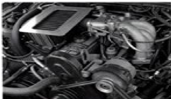
Turbo charged V-8 powerplant

PAH PUBLISHING International 711 Hillcrest St. Monett, MO 65708 www.pahpub.com