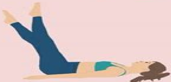
5. THE HUNDRED