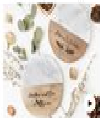
Custom Engraved Marble Wood Coasters | Round Marble...