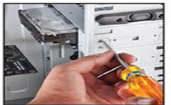
6 Install the hard drive