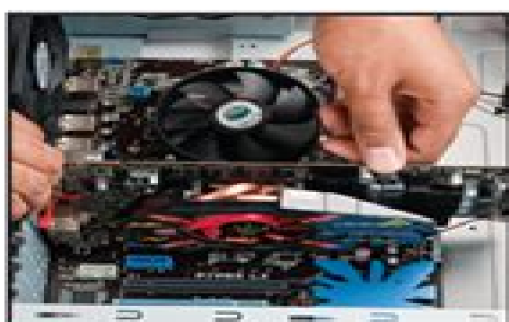
8 Install the graphics card