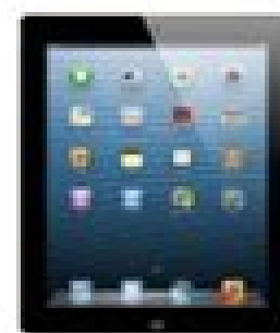
Apple iPad 4