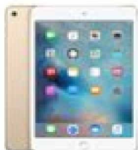
Apple iPad mini 4