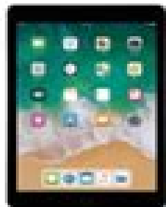
Apple iPad 6