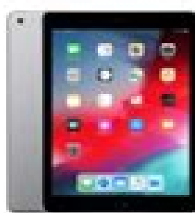
Apple iPad 5