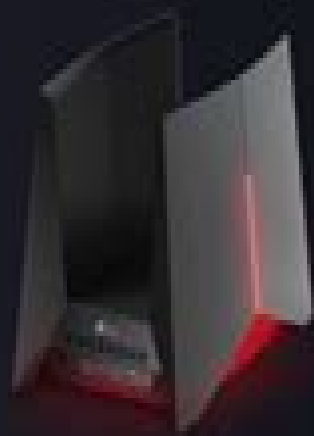
Wi-Fi 7 Gaming Routers