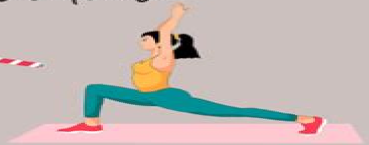
10 minute stretch