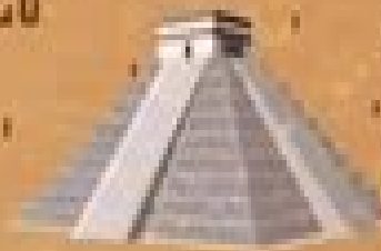
CHICHEN ITZA YUCATÁN