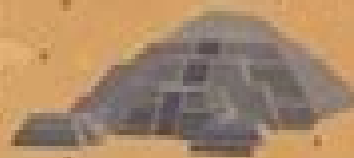
TEOTIHUACAN EDO DE MÉXICO