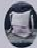
Home & Living