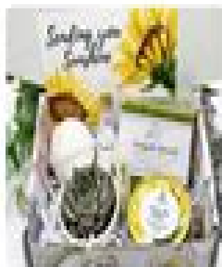
Thinking of You - Succulent Gift Box - Missing You - Friendship...