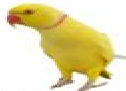
Indian Ringneck Parakeet