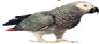
African Grey Parrot