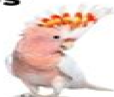
Major Mitchell's Cockatoo