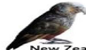
New Zealand Kākā