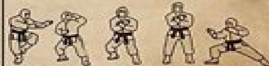
HICHO KOSEI JUMONJI HENKA JUMONJI KIHON IHEN HOGI