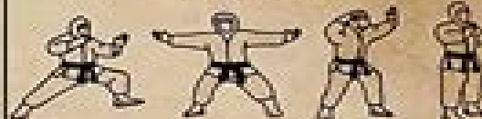
IHEN HIDARI HIRA ICHI MONJI HOKO KONGO GASSHO