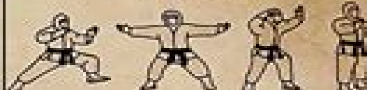
IHEN HIDARI HIRA ICHI MONJI HOKO KONGO GASSHO