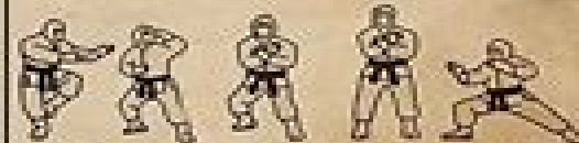
HICHO KOSEI JUMONJI HENKA JUMONJI KIHON IHEN HOKI