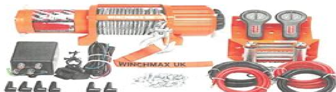
5,000lb (2,270kg) Winches