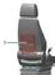
Fig. 441 Storage net